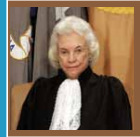
Sandra Day O'Connor