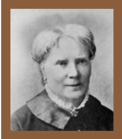
Elizabeth Blackwell ●

● British monarch who ventured into Tanzanian forests to study wild-chimpanzees