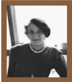
Doris Day ●

● American photographer and photojournalist known for her Depression-era work