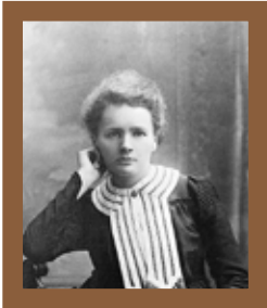
Marie Curie ●

Match the famous women to their achievements.