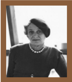
Doris Lessing ●

● American photographer and photojournalist known for her work during the Great Depression - era