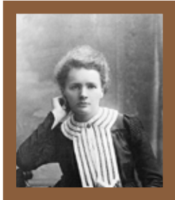
Marie Curie ●

Match the famous women to their achievements.