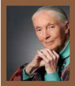
Jane Goodall ●