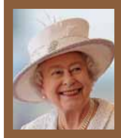
Queen Elizabeth II

The first woman to venture into Tanzanian forests to research wild-chimpanzees