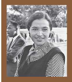
Rosa Parks ●

● American photographer and photojournalist known for her Depression-era work